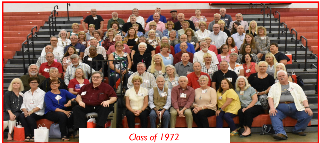
Class of 1972

This year's dinner was on Friday, September 9 in Alumni Hall. The night before the Golden Bear Dinner, the Class of '62 held its reunion at Colonial Gardens. The following night, the Class of '72 held its reunion at Holiday Inn – Hurstbourne Lane.