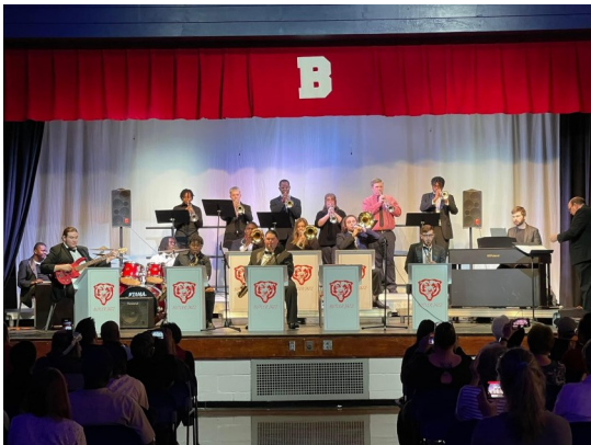
The Butler Jazz Band performs on stage in Alumni Hall