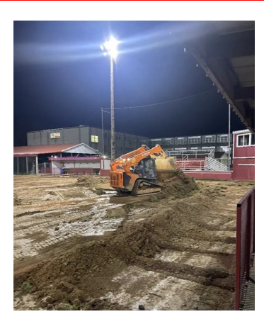
Construction begins on new turf field

Courier Journal - Butler Debuts Turf Field