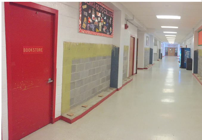
Lockers are being removed. This picture, between the bookstore and the cafeteria, show the block that was installed in 1953-54. It is unblemished and looks new. All lockers, on the first floor, in this area will be removed.